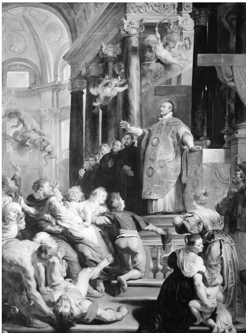
Figure 8. Peter Paul Rubens, 'The Miracles of Saint Ignatius of Loyola' (1615/16), Kunsthistorisches Museum, Vienna