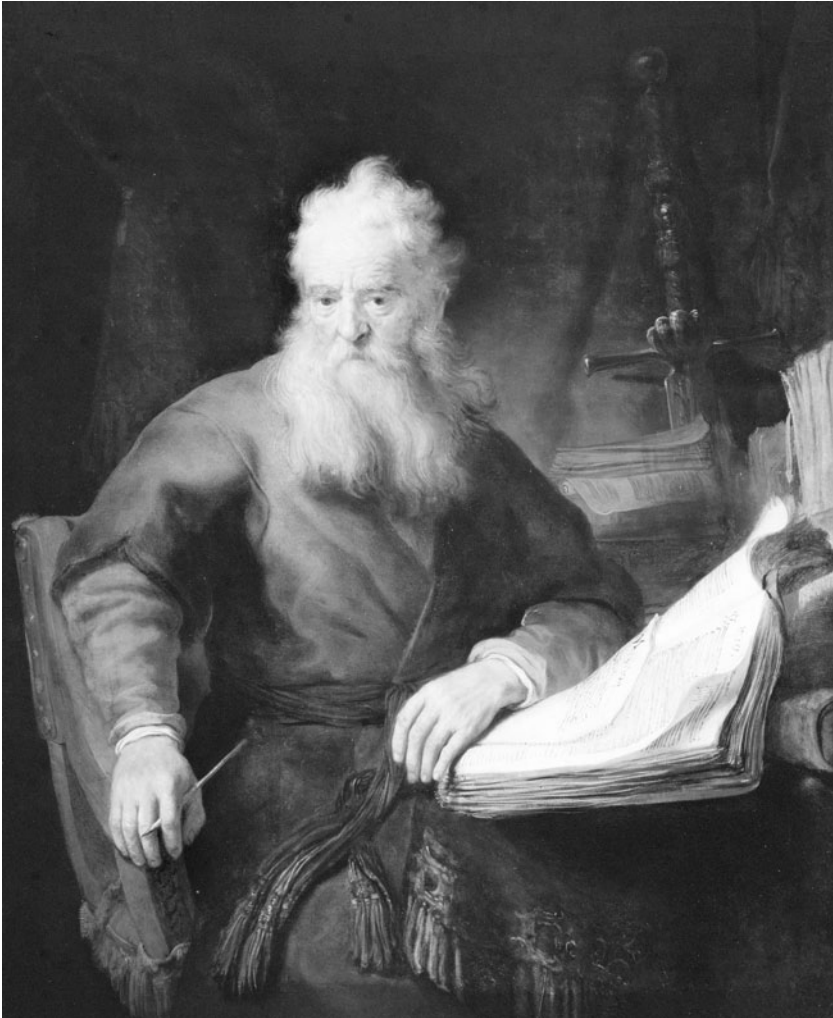
Figure 4. Rembrandt Harmensz van Rijn, Saint Paul (1633?), Kunsthistorisches Museum, Vienna

for their own churches in the seventeenth and eighteenth centuries. But the great artists of the Counter-Reformation were also integral to the articulation of the Baroque style: Carracci, Bernini, Rubens, Tintoretto, Caravaggio. The Baroque style of art, like its counterpart in theatre, is more expressive of a nuanced range of emotions and spiritual states than were its medieval