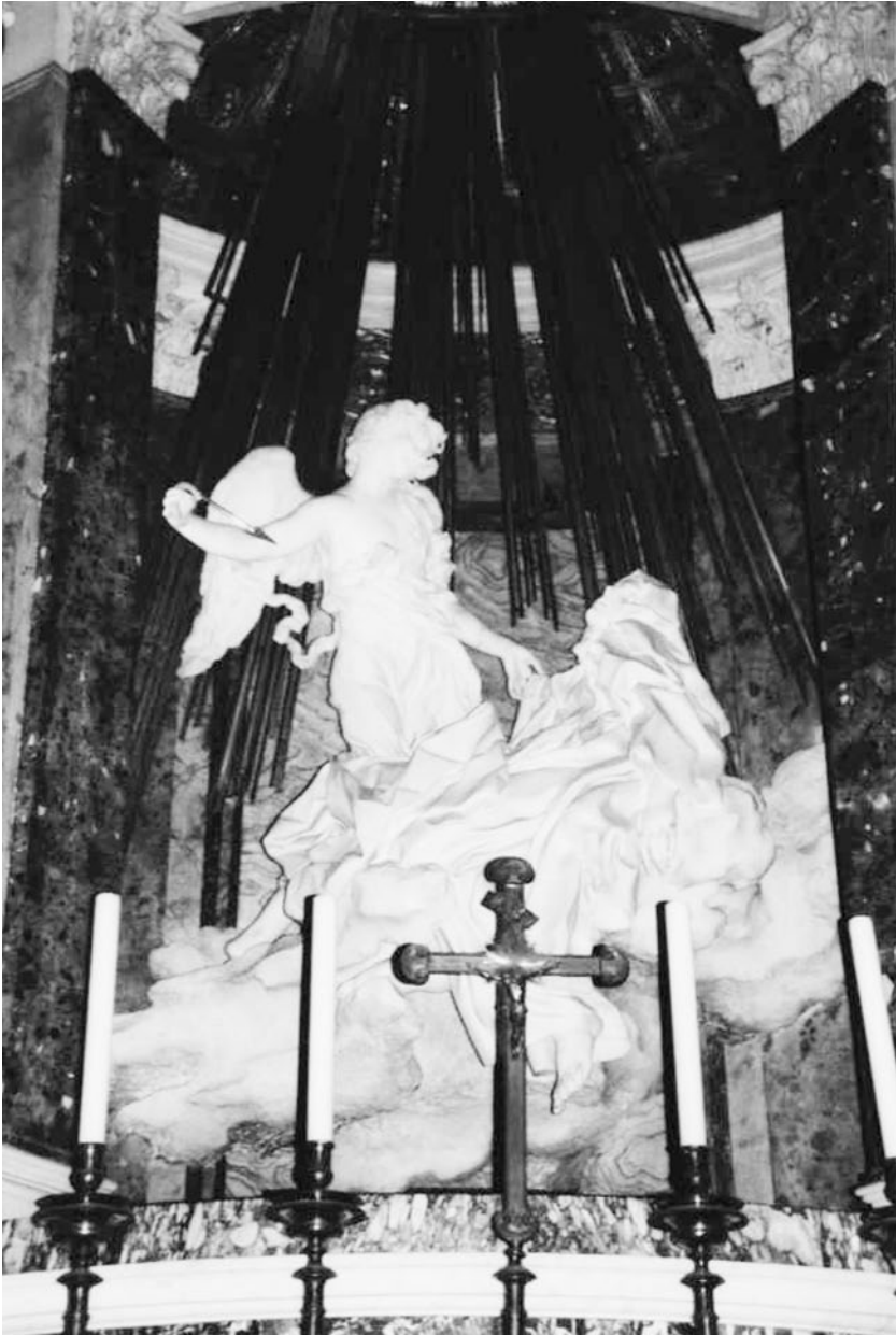
Figure 7. Gian Lorenzo Bernini, 'The Ecstasy of Saint Teresa', Cornaro Chapel, Rome