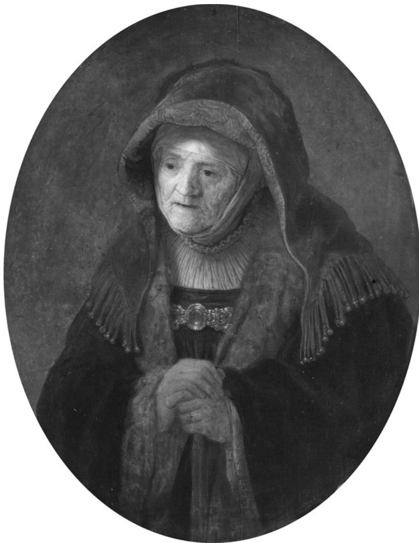
Figure 3. Rembrandt Harmensz van Rijn, Saint Anna (1639), Kunsthistorisches Museum, Vienna

or marble dimensions of the mystery of Incarnation – the import of gravity, the consequences of materiality for luminosity, ‘apotheosis’, a particular subject of Reformation Catholic art, and flight.