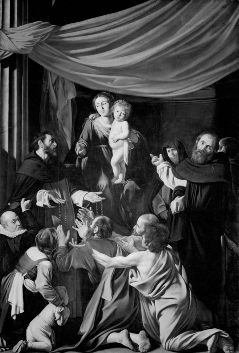
Figure 5. Michelangelo Merisi da Caravaggio, 'Madonna of the Rosary' (1606/7), Kunsthistorisches Museum, Vienna